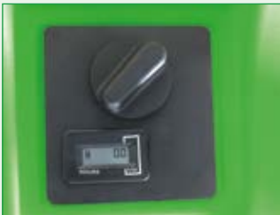
Operating hours counter, series