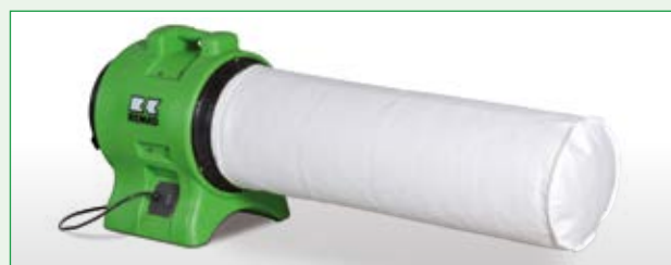
Optional dust bag