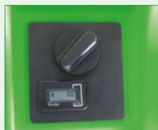
Optional operating hours counter