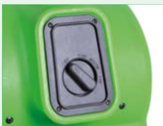
3 fan speeds