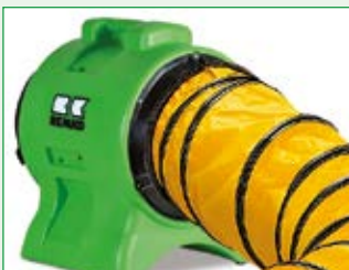
Hot air hose connection