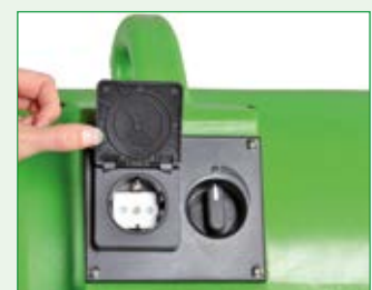
Optional socket for connecting further devices (max. 10A)