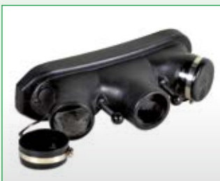
Air distributor head for hose connection