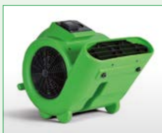
Various mounting positions