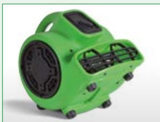
Various mounting positions