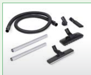
Included accessories for RK 45