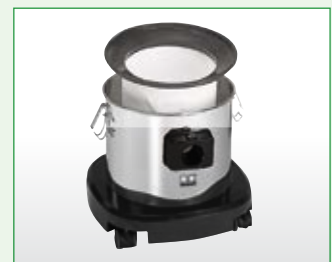
Permanent dirt filter