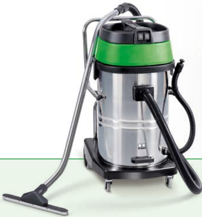
REMKO RK 75 Dry material and water vacuum cleaner Container volume: 60 litres

The versatile dry material and water vacuum cleaner vacuums up dirt and water