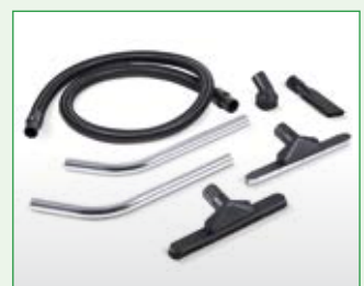
Included accessories for RK 55 and RK 75